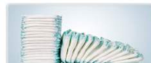
DIAPERS: SIZES NB & #1—SMALL PACKAGES SIZES #1 TO #5—LARGE PACKAGES/BOXES

Proceeds go to: Respect Life Central Broward 527 NE 13th Street Fort Lauderdale, FL 33304 (954) 527-0810