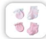
BABY SOCKS & MITTENS