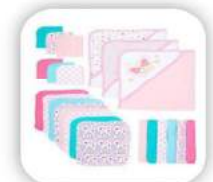
BABY TOWELS, WASH- CLOTHS, BURP CLOTHS, RECEIVING BLANKETS