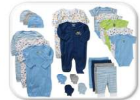
ONESIES & PJS