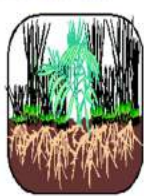
The Weedy Soil