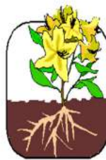
The Good Soil