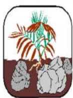
The Rocky Soil