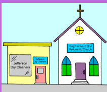
CLEANLINESS IS NEXT TO GODLINESS

The House of God is our privileged location to meet the Lord. May we take collective ownership to assure that it is at all times maintained in a condition of respect and welcome. Kindly replace booklets in the pew book holders and gather any loose papers.